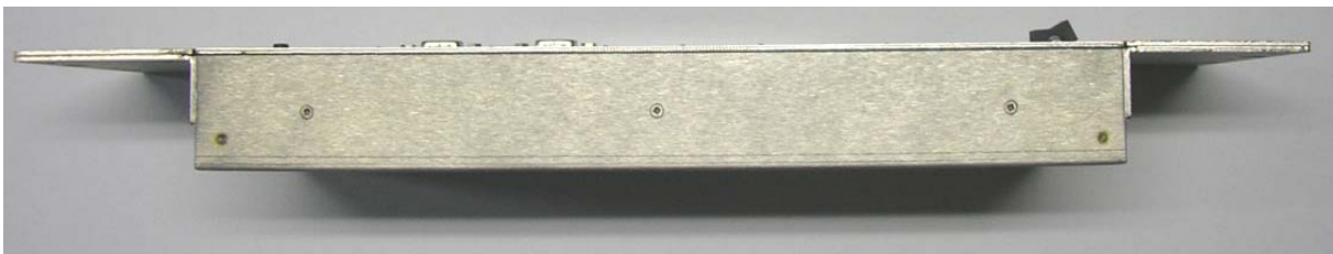
SCU6 top view

The front panel provides the following elements: