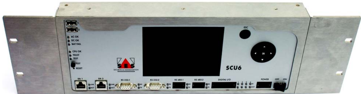
SCU6 front panel, LCD screen and keypad

The SCU6 is housed in a lightweight 19-inch 3U chassis that is less than 3 inches deep!