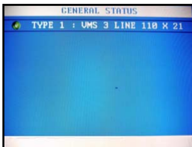
General Status Display

The sign can be operated directly at the Controller Cabinet (or DMS housing) using the built-in full color LCD panel and keypad (or by connecting a laptop to one of the units RS 232 and Ethernet ports). The LCD screen uses an indicator icon to allow the operator to quickly determine overall sign status. If all systems are operating properly a green indicator is displayed, as shown in the sample display below.